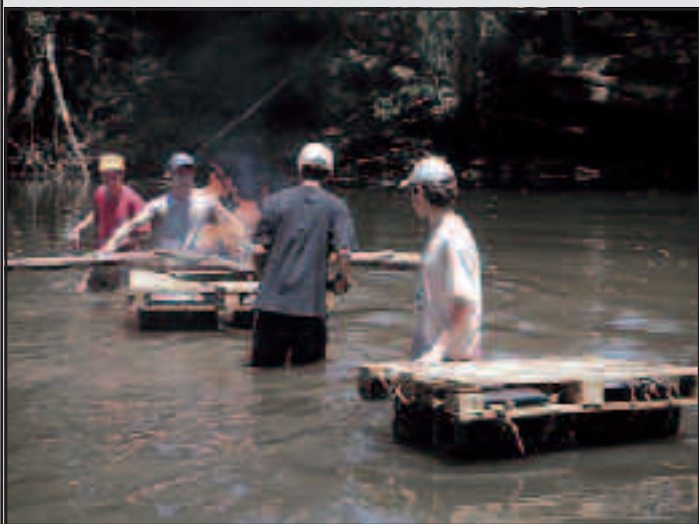
Survivors getting to grips with the Fire Challenge

This Survivor had a Pirate theme and was held on a stunning river near the Groendal Mountains. The Survivors were given hardly any equipment and had to compete in Challenges to earn 'dollars' so as to buy equipment to build a campsite. The Tribe that built the best campsite and won the most challenges would win Survivor 2.